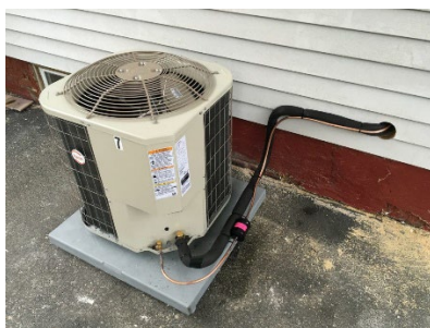
AC Refrigerant Line Insulation Missing