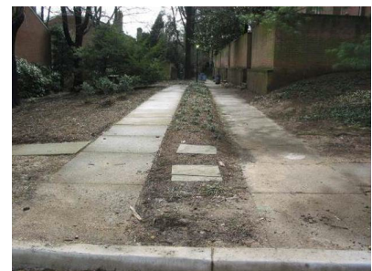
Erosion onto Sidewalk