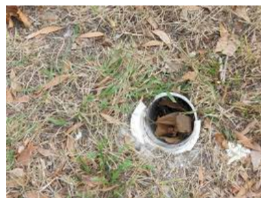
Missing Sewer Cap